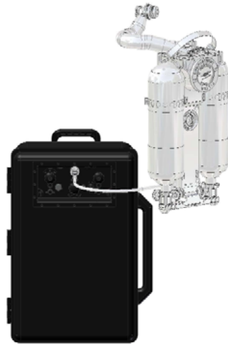
The Wilcox HP/LP Quick-Fill Charging System Performing a Fill Operation using the Waist Level Charging Hose from the PATRIOT ®

Once connected, the operator can open the cylinder(s) on the PATRIOT , then on the HP/LP Quick-Fill Charging System , providing a free flow between the two systems. This extends the PATRIOT's operational time with up to 120 minutes of additional air. Refilling takes less than two minutes.