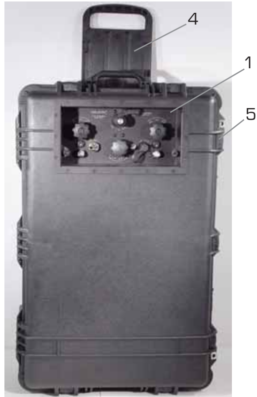
Quick-Fill Charging System (Handle Extended)