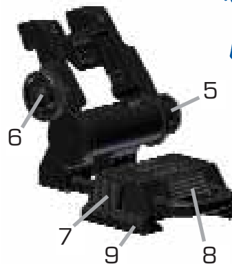
Universal NVG Mount