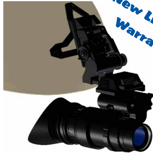
Deployed with Dovetail NVG Interface Shoe