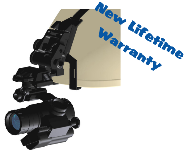
The Wilcox AN/PVS-14 Arm Illustrated with the Wilcox L2 G04 NVG Strap Mount, NVG Interface Mount, and AN/PVS-14 NVG

The Wilcox AN/PVS-14 Arm with NVG Interface Shoe provides a durable connection for mounting an AN/PVS-14 goggle to a Wilcox Combat Helmet Interface Mount. It can be easily mounted and dismounted from the AN/PVS-14 goggle by means of a thumb screw, and allows the operator to select the height and angle for comfort with the ability to make fine adjustments to the Arm.