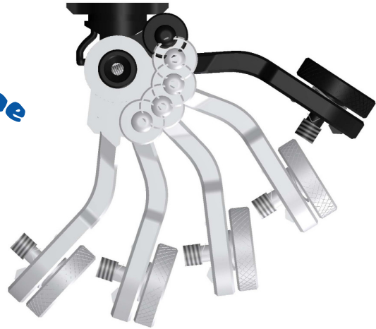
110° Range of Motion Accommodates Left or Right Eye Dominance

The Wilcox NVG Mounting Systems Product Line is featured with a wide range of adjustments to customize the position of the Night Vision Goggle for proper eye position and relief.