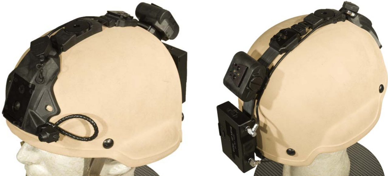
The Mission Helmet Recording System (P/N 43500G01) Configured for Daytime Operation

The Wilcox Mission Helmet Recording System (MHRS) for the AN/PVS-15/18 is comprised of a L 4 Dashboard Assembly with miniature Day and Night Camera Module, two (2) Quick Change™ Power Supply Modules , and Miniature Video and Audio Recorder that all mount to a MICH/ACH helmet by means of a powered track. This unique track carries power from a Quick Change™ Power Supply Module to the mounted devices. Currently open to SOF sales only.